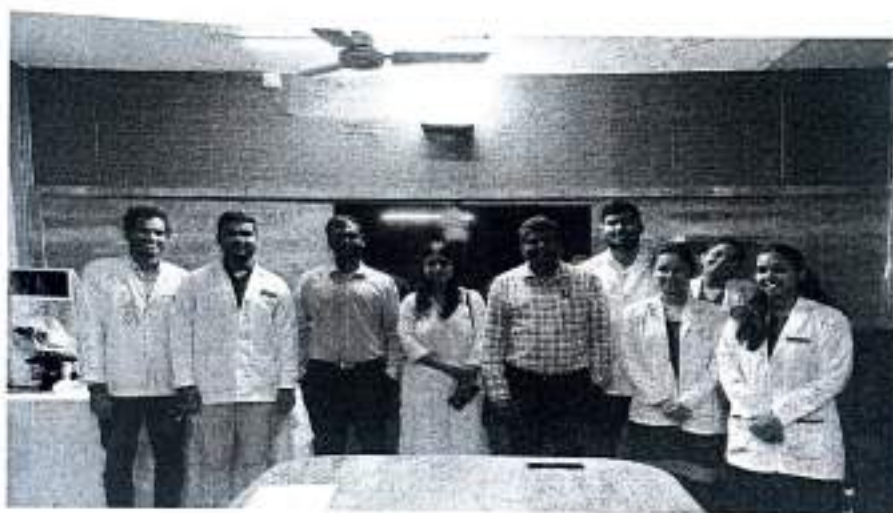
Students and staff of KLE along with Clove Dental faculty.