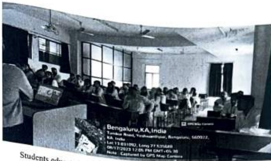
Students educated about opportunities by member of Clove dental