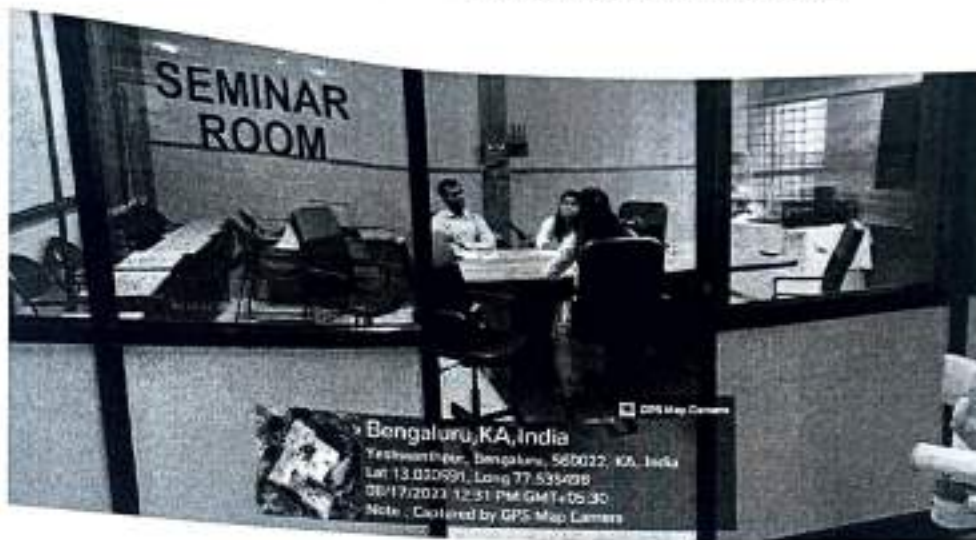
Individual interview organized by Clove Dental for the students.